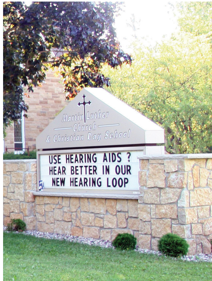
Martin Luther Evangelical Lutheran Church, Oshkosh, Wi

This simple technology, which also enables a home TV to broadcast through one's hearing aids, is now being advocated by a growing number of hearing leaders. In 2010, the Hearing Loss Association of America ("the nation's voice for people with hearing loss") and the American Academy of Audiology (the world's largest association of hearing professionals) announced a joint "collaborative public education campaign 'Get in the Hearing Loop.'" The campaign aims "to enlighten and excite hearing aid users, as well as audiologists and other professionals who dispense hearing aids, about telecoils and hearing loops and their unique benefits." Hearing loops are coming to America.