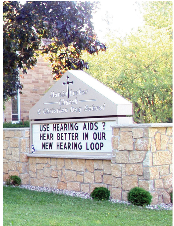
Martin Luther Evangelical Lutheran Church, Oshkosh, Wi

This simple technology, which also enables a home TV to broadcast through one's hearing aids, is now being advocated by a growing number of hearing leaders. In 2010, the Hearing Loss Association of America ("the nation's voice for people with hearing loss") and the American Academy of Audiology (the world's largest association of hearing professionals) announced a joint "collaborative public education campaign 'Get in the Hearing Loop." The campaign aims "to enlighten and excite hearing aid users, as well as audiologists and other professionals who dispense hearing aids, about telecoils and hearing loops and their unique benefits." Hearing loops are coming to America.